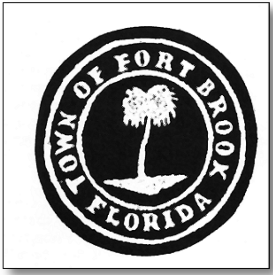
Original seal of the Town of Fort Brook [e], which was found on the site of a former city dump on hooker's Point in 1952.